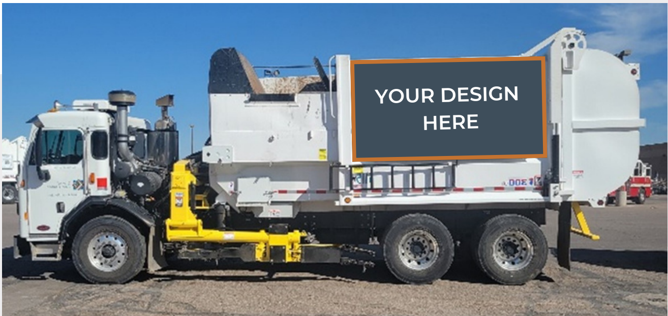
*Image is of actual City vehicle